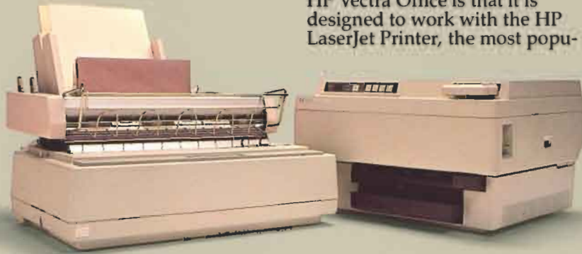
Easy interface to HP's new daisywheel printer and the LaserJet printer

keystrokes. And on-screen help geared to the operation you are performing. So you don't have to learn a command until you need it. Should you acciden-