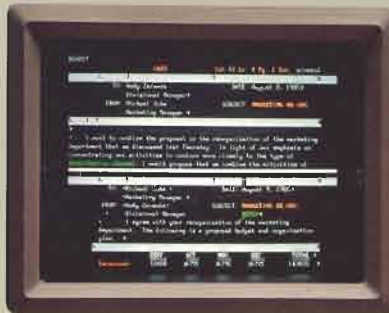
Windows let you edit two documents

We took what you said to heart. And designed the workstation you've been waiting for: HP Vectra Office.