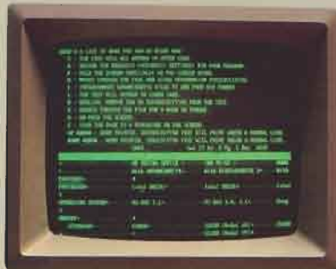
Three levels of on-screen help