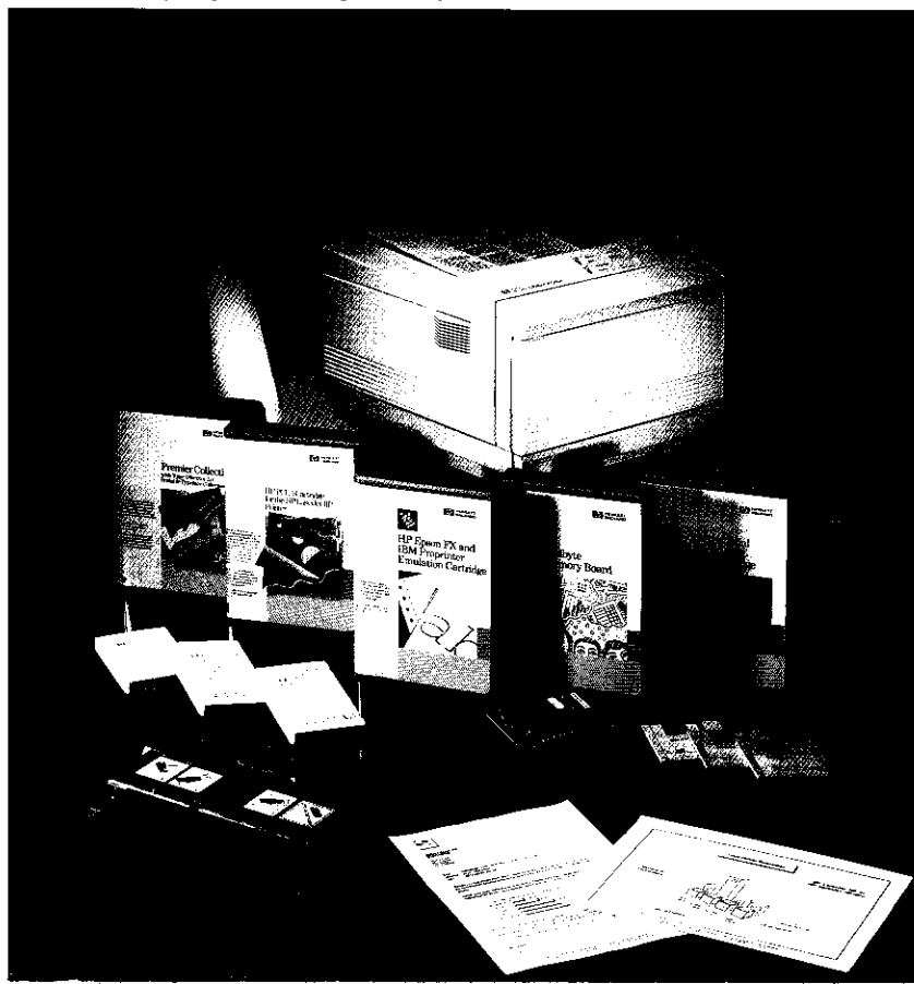
HP LaserJet IIP plus printer with optional tray and accessories