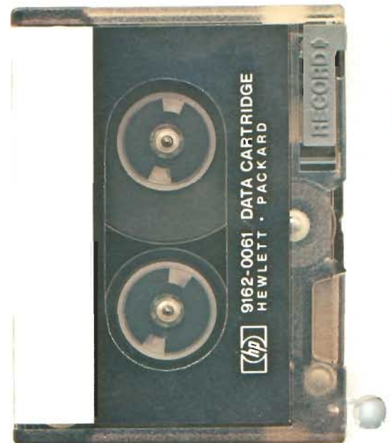
Shirt-pocket Mini Cartridge Shown Actual Size.