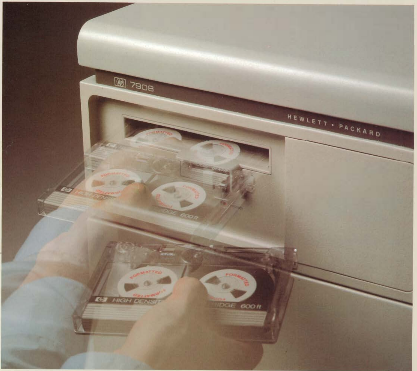
The simplicity of the HP 250: fast and convenient data transfer