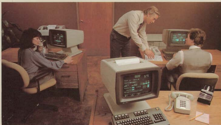
The friendly HP 250/30 Small Business Computer

Today, thousands of people are using the HP 250 Small Business Computer system to solve a wide range of business problems. Why did they select the Hewlett-Packard 250? Because it is an innovative solution to a growing concern: how to improve business productivity. The HP 250 offers a unique combination of power, reliability, growth, support, and simplicity of design and use. In applications as diverse as general accounting, order entry, medical billing, inventory control, scheduling and job costing, the HP 250 system is helping people to be more productive.