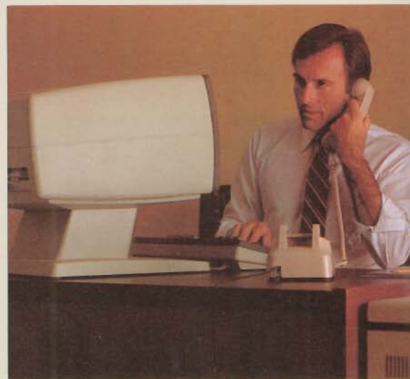
The compact, quiet HP 250/20.

The high-performance HP 250/50, for a wide range of office applications.