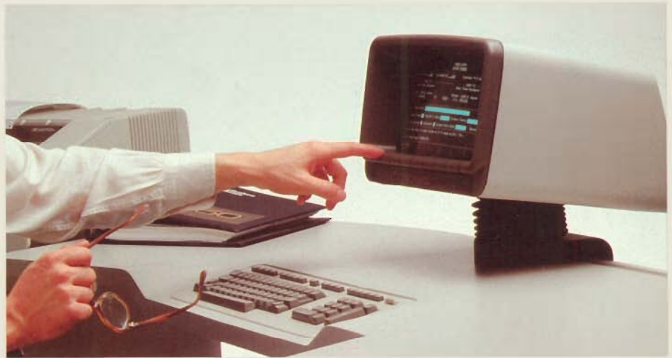
The human engineered HP 250/35, with integral keyboard and display screen.

Among the several unique features offered by IMAGE/250 is the ability to perform FIND and SORT operations across data sets with logical "threading." Sort operations can be alphanumeric or numeric; sort fields in either ascending or descending order, from different data sets, can be selected.